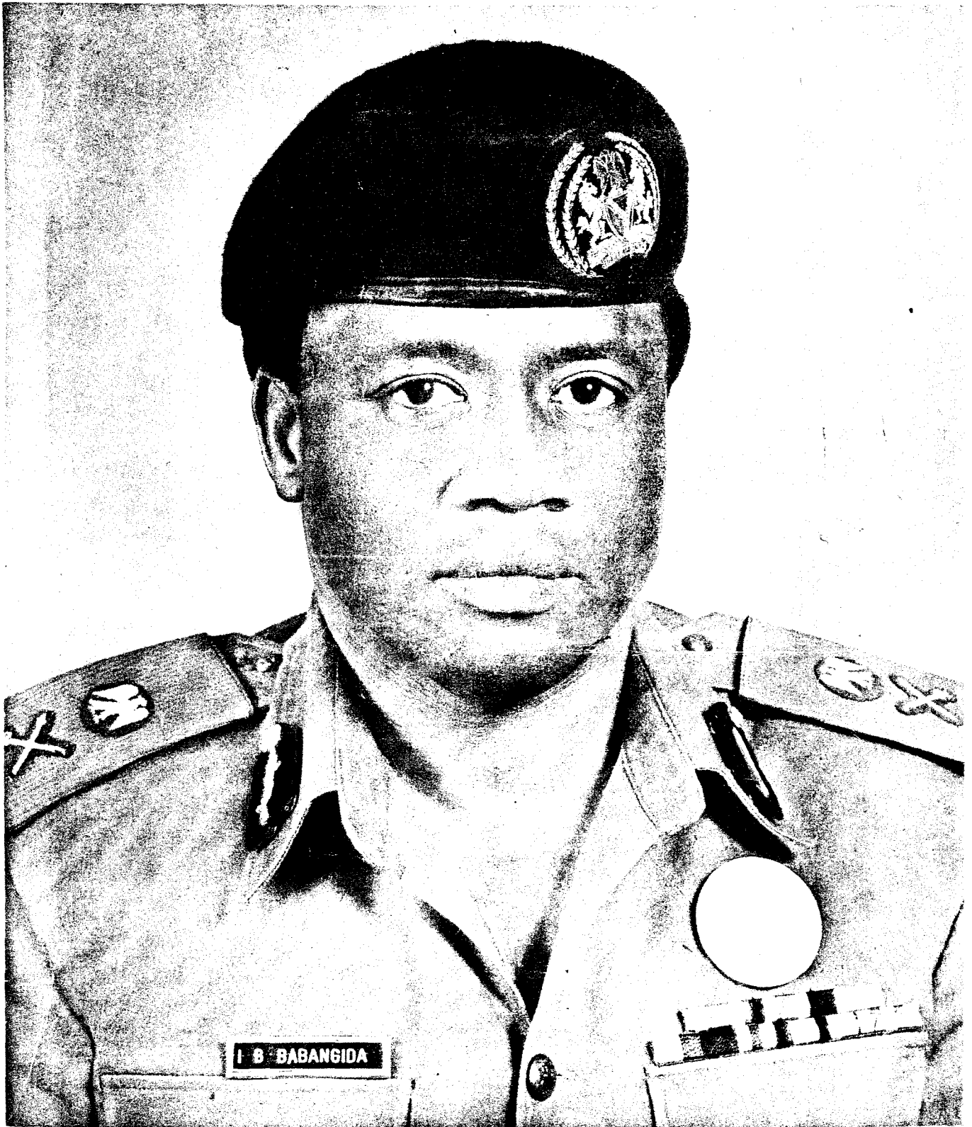
Visitor: GENERAL IBRAHIM B. BABANGIDA CFR, fss, mni President of the Federal Republic of Nigeria Commander-in-Chief of the Armed Forces.