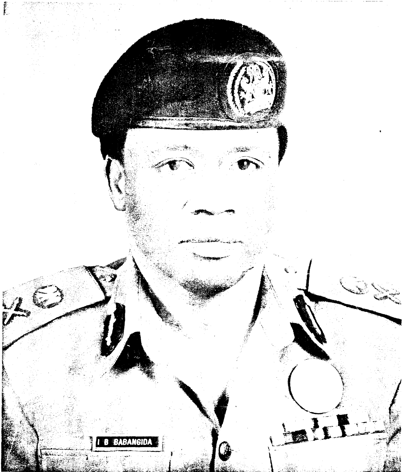
Visitor: GENERAL IBRAHIM B. BABANGIDA , CFR, fss, mni President of the Federal Republic of Nigeria Commander-in-Chief of the Armed Forces