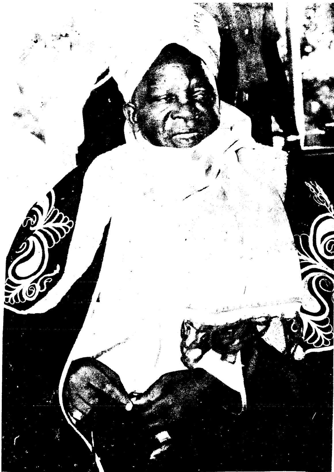
H.R.H. ALHAJI ZULKARNAINI GAMBARI MOHAMMED, CFR, Hon. LL.D Hon. LL.D. (Akure) Hon. LL.D. (Ilorin) Aiyelabowo v. Emir of Ilorin Chancellor, Federal University of Technology, Akure